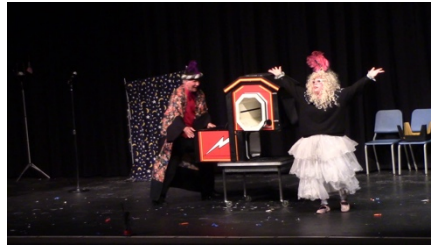
Kohl & Company

one of the top ten comedy acts in magic today.