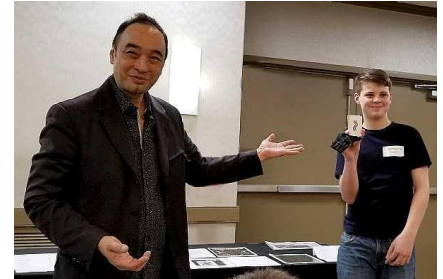
Finding the ESP selection.

number, 7 was named. All the questions were asked and answered before the deck was even in play. Another spectator dealt down showing the cards face up to number 6. Next card turned over was the 3 of Hearts. This made ACAAN look ultra-real.