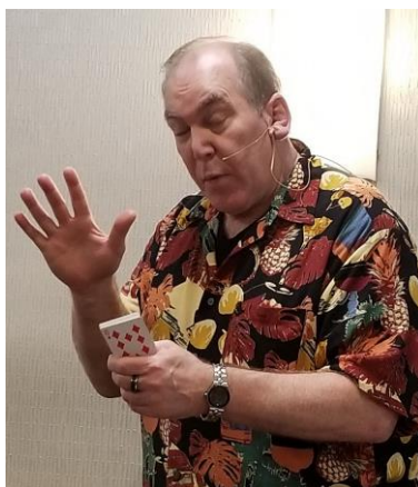
The rising card effect

In this case, the ring, worn on the left middle finger is always there are ready for use.