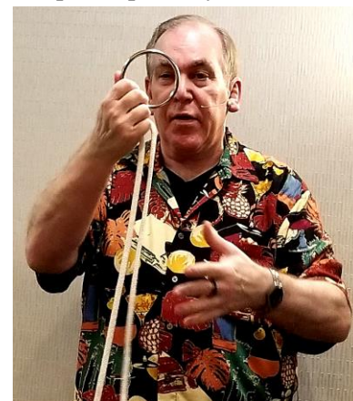
The Alien Ring