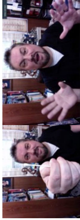
Now you see the cotton swab; now you don't.

needed to make a gimmick out of a sixth playing card with the