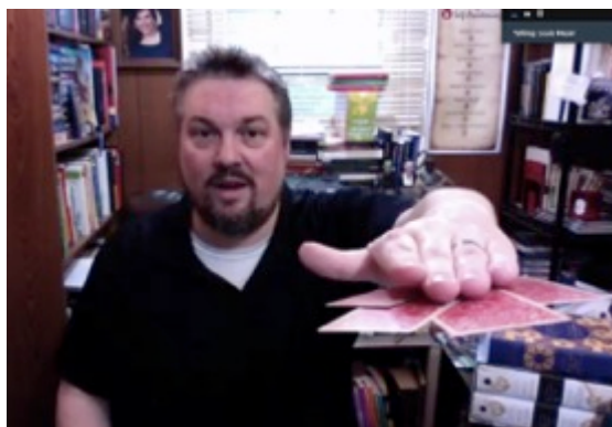
The cards seemingly levitate.

Louis demonstrated how it can easily be made from five old playing cards. The only requirement is that one of the cards be obviously different from the other four. For example, using a red