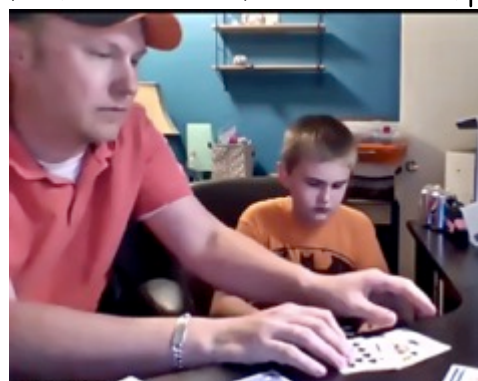
Assembling the middle card trick

The five cards are shown side-by-side in the magician's